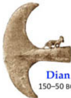
Dian 150–50 BCE

So not a Chinese but a Yue word for 'adze' was transmitted to India.