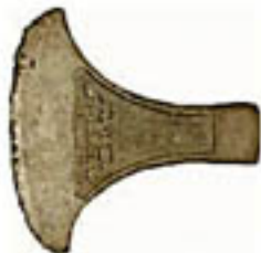
Western Zhou period until Warring States period (1045 – 770 BCE)