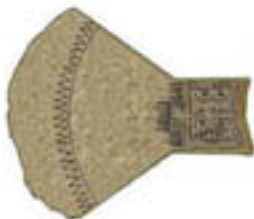
(475 – 221 BCE)